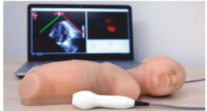
Cardiac US simulator

Opportunity will be provided for hands-on practice, using simulators developed by the group in collaboration with computer scientists and bioengineers.