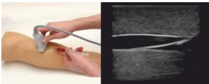
US guided line insertion using blue phantom technology

The objective is to introduce participants to the application of ultrasonography as a bedside tool to help answer targeted clinical questions and improve procedural success.