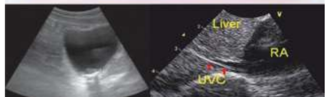
Bladder & Vascular Access US using phantom technology

The instructors are a group of neonatologists from Canada & India with specific training and expertise in point of care neonatal ultrasound.